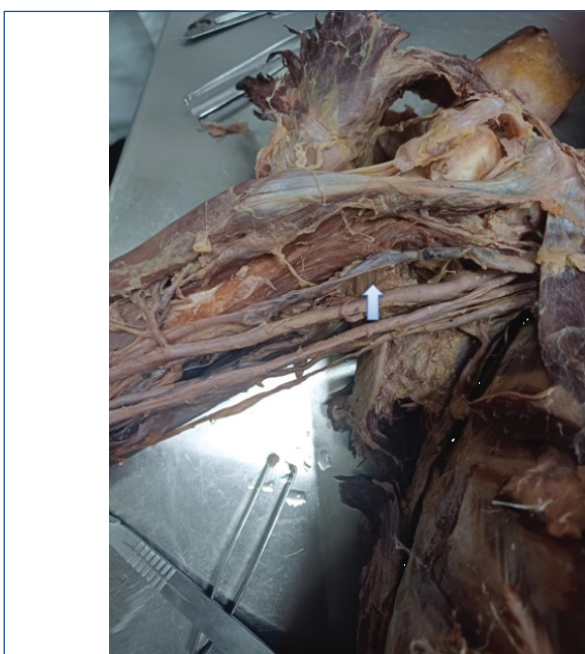
[Table/Fig-3]: Right single normal axillary vein.

to occur if there are underlying mesenchymal connective tissue abnormalities [2]; however, no such connective tissue anomalies were found in this cadaver.