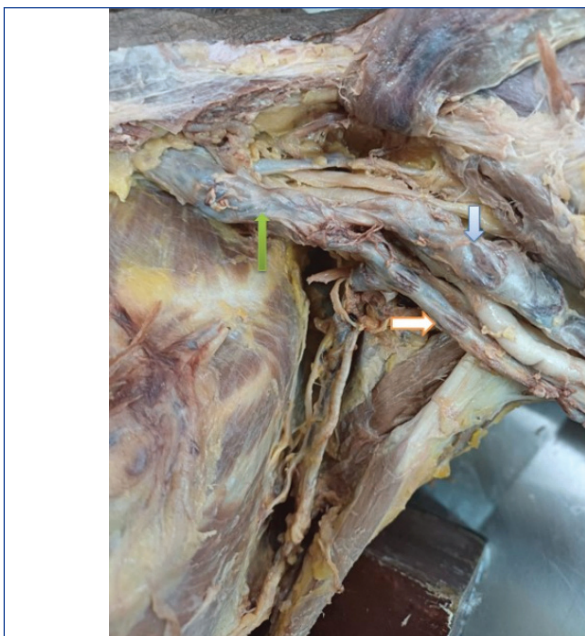
[Table/Fig-2]: Left medial axillary vein (white arrow) and left lateral axillary vein (blue arrow) unite proximally to form a common fused vein (green arrow).